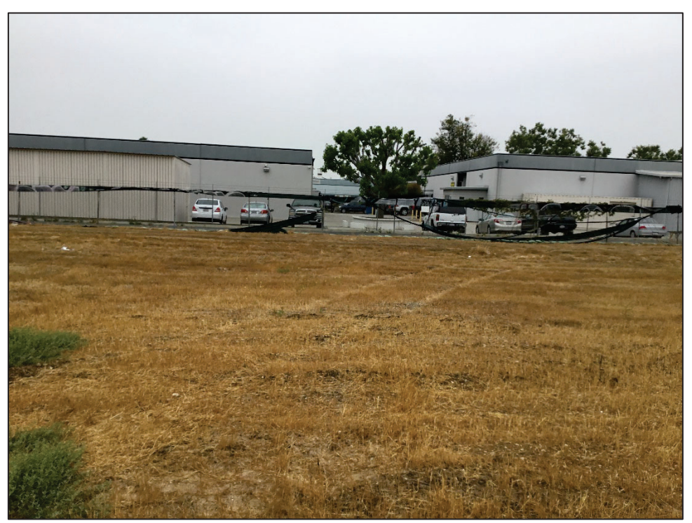
Figure 1. Overview of Project Site looking north