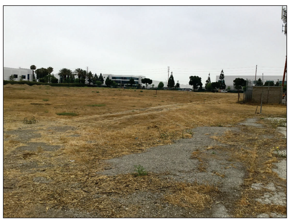
Figure 3. Overview of Project Site looking south.