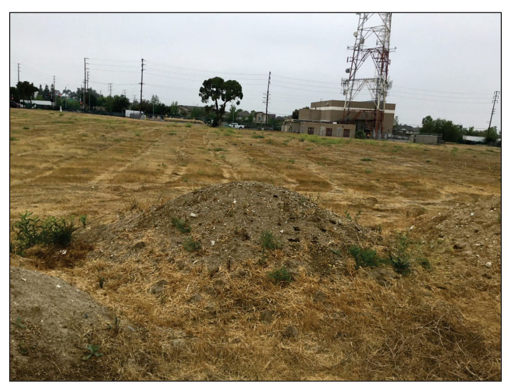
Figure 4. Overview of Project Site looking west.