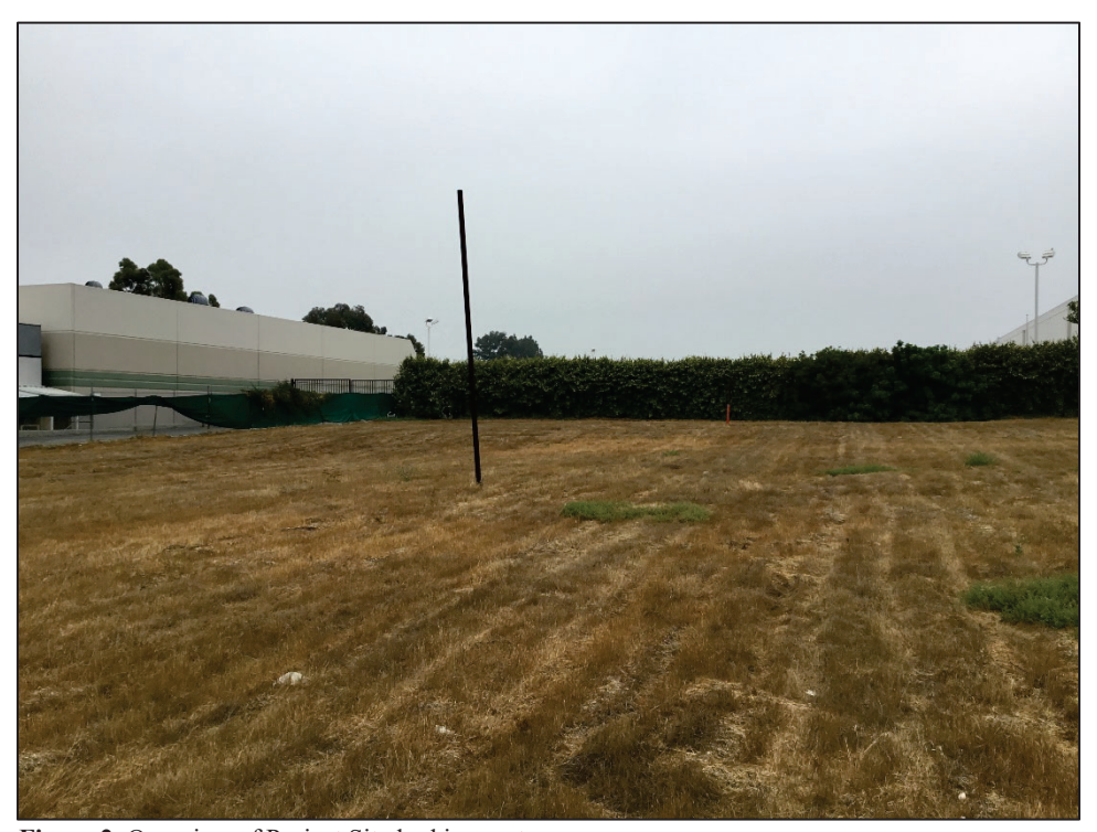
Figure 2. Overview of Project Site looking east.